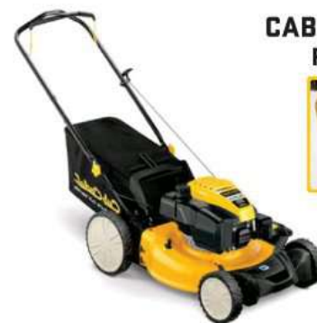
CAB CADET 21 INC Push Mower

Displacement 196cc | Power Output 4.5hp | Deck Size 21 inch alloy