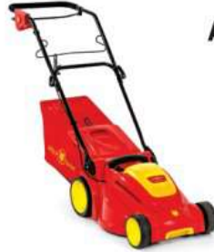
A 370 E

Power Output 1400 w Deck Size 34 cm Gras Catcher 35 ltr