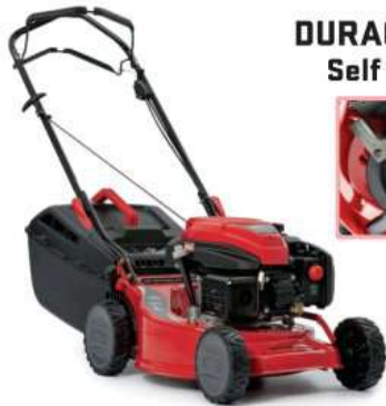
DURACUT 850SP Self Propelled

Displacement 159cc | Power Output 4.1hp | Deck Size 18 inch