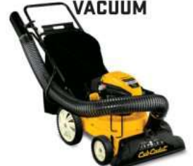
CHIPPER SHREDDER VACUUM

159 cc, Vacuum Width 24 inch Chipping Capacity 1.5 inch