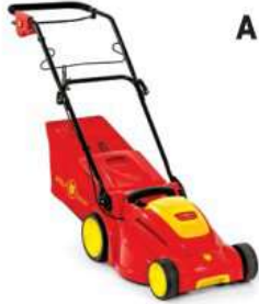
A 340 E

Power Output 1400 w Deck Size 34 cm Gras Catcher 35 ltr