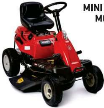
MINI RIDE ON MOWER

Displacement 382cc | Power Output 10.8hp | Deck Size 30 inch