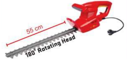
HSE 55 V

Power Output 230 v /650 w Blade Length 55 cm Weight 4.0 kg