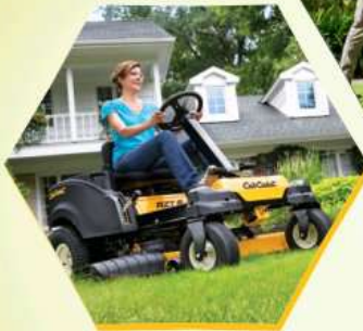
ZERO TURN MOWER