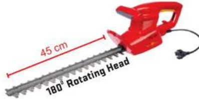
HSE 45 V

Power Output 230 v /600 w Blade Length 45 cm Weight 3.8 kg