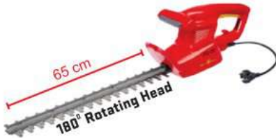
HSE 65 V

Power Output 230 v /700 w Blade Length 65 cm Weight 4.2 kg