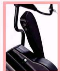
BLADE BRAKE CLUTCH