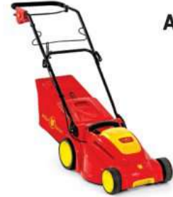
A 400 E

Power Output 1600 w Deck Size 37 cm Gras Catcher 40 ltr