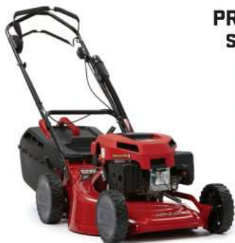
PROCUT 950SP Self Propelled

Displacement 173cc Kohler Engine | Power Output 4.2hp | Deck Size 19 inch alloy