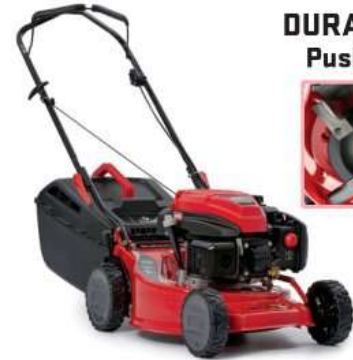
DURACUT 820 Push Mower

Displacement 382cc | Power Output 10.8hp | Deck Size 30 inch