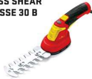
GRASS SHEAR FINESSE 30 B

Power Output 3.6 v /1.5 Ah Cut Width 150mm Run Time 40-50 min