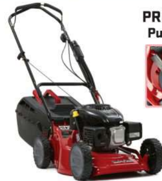
PROCUT 720 Push Mower

Displacement 159cc | Power Output 4.1hp | Deck Size 18 inch