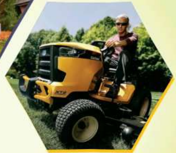
RIDE ON MOWER